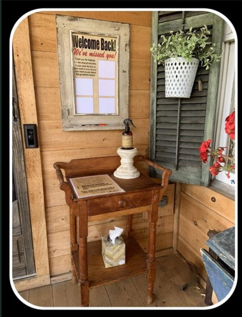
Speckled Hen 38 Saratoga Rd