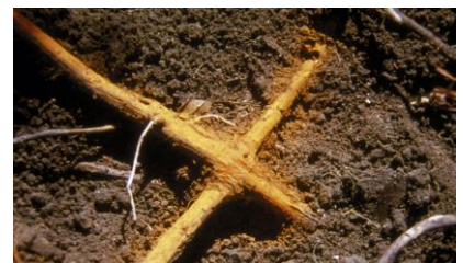
Root graft