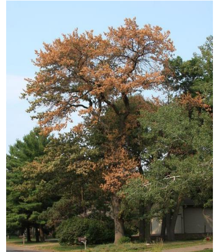
Oak tree killed by oak wilt

Spread underground occurs when roots of nearby red group oaks graft to each other (fuse together), creating a connection through which nutrients and the disease can move. In the Midwest, large blocks of red oak forests have died from the disease in a single season due to their vast network of interconnected roots. In contrast, white group oaks are much less likely to create root grafts, and spore mats rarely form under their bark, significantly reducing the chance of spread from these trees.