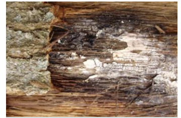
Fungal spore mat under bark