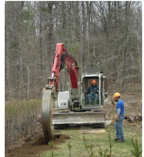
Trenching to break grafted roots