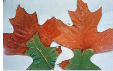
Diseased red oak leaves