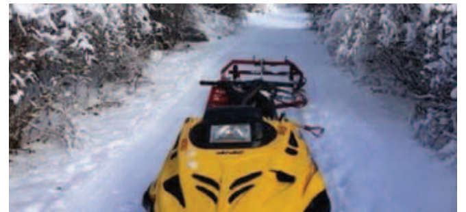
First Outing December 12, 2014